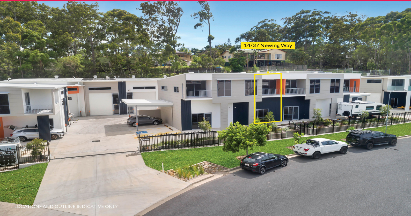
LOCATIONS AND OUTLINE INDICATIVE ONLY