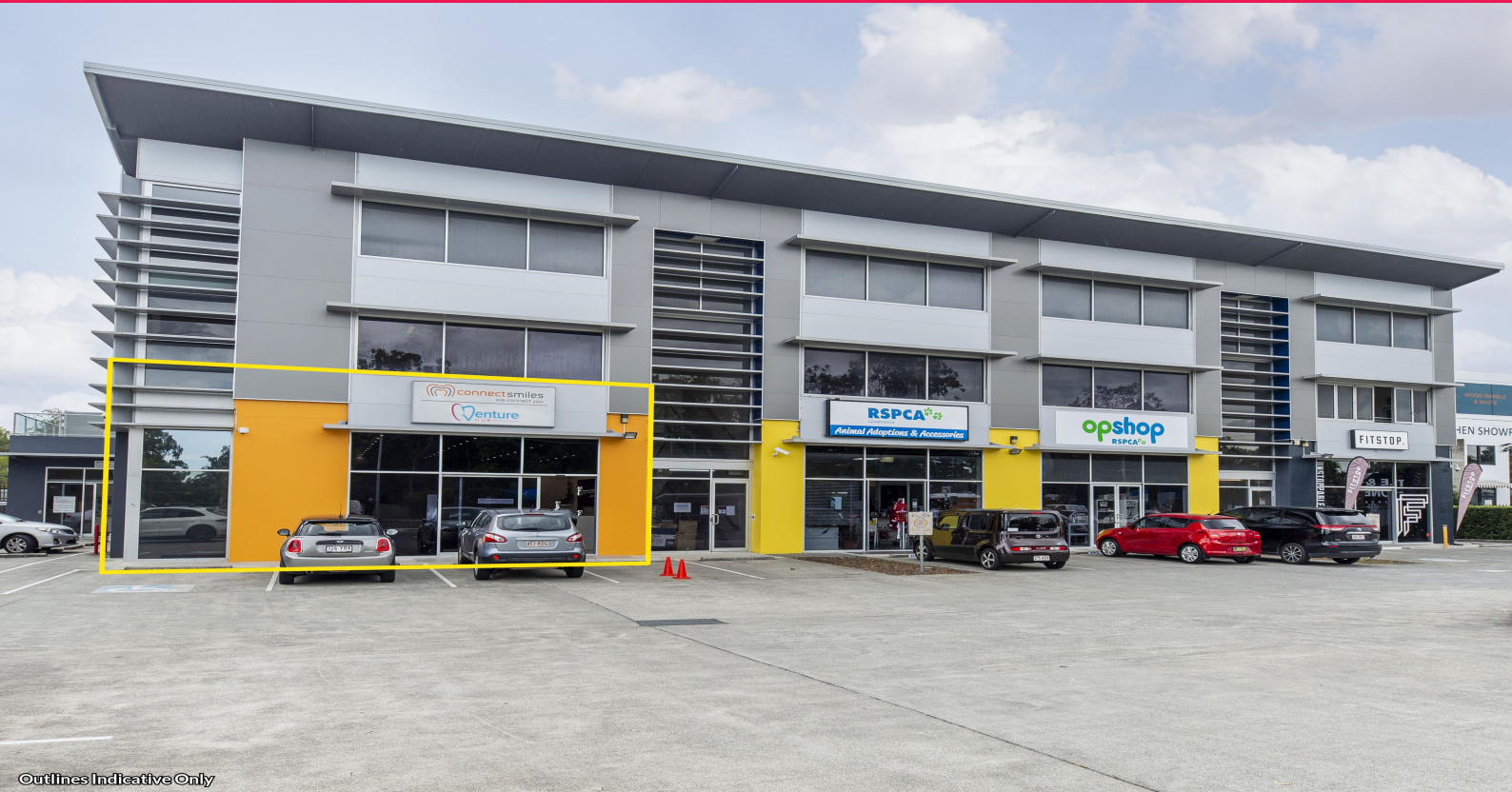
Outlines Indicative Only