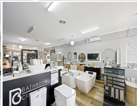
545A - 545B WHITEHORSE ROAD, MITCHAM