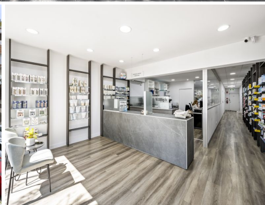
536 WHITEHORSE ROAD, MITCHAM