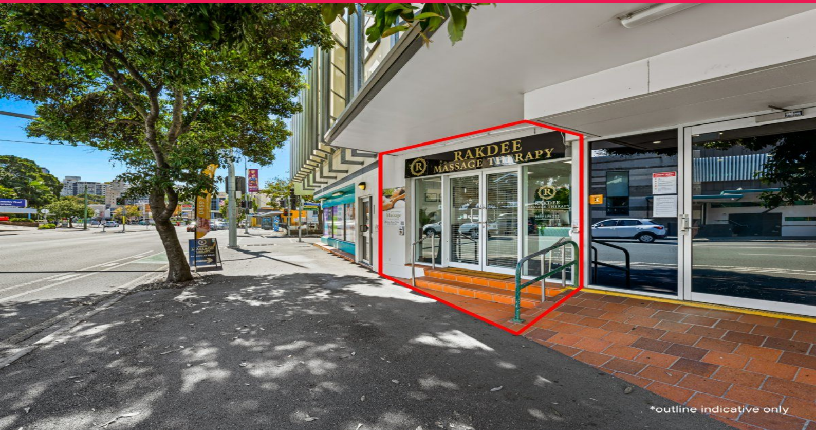
*outline indicative only