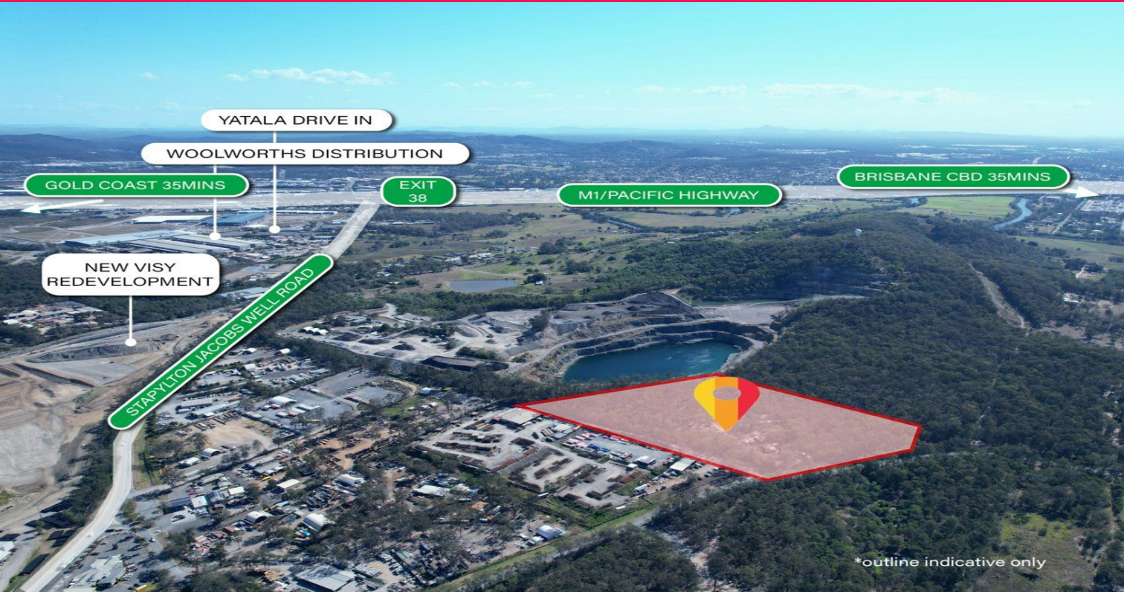
*outline indicative only