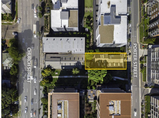
19 Porter Street, Ryde NSW 2112