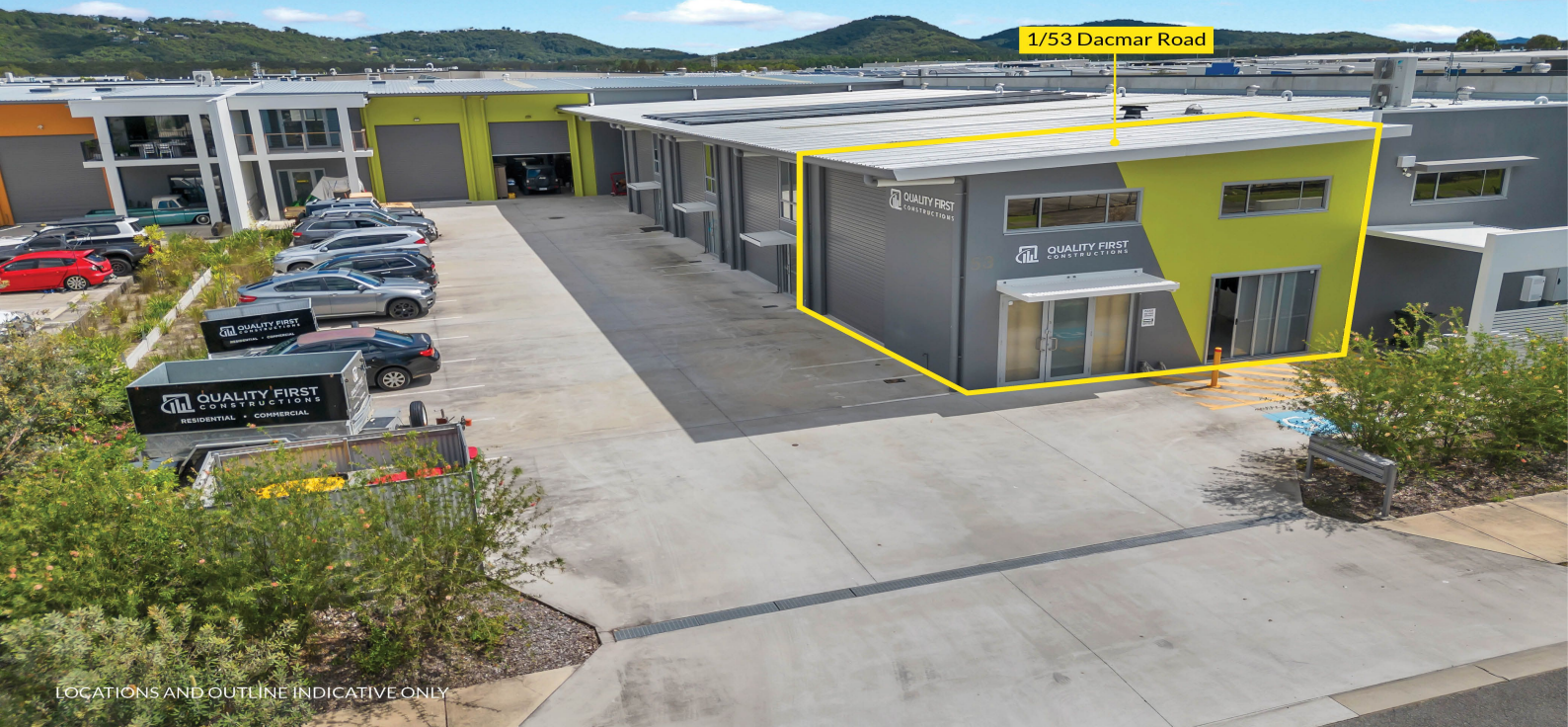
LOCATIONS AND OUTLINE INDICATIVE ONLY