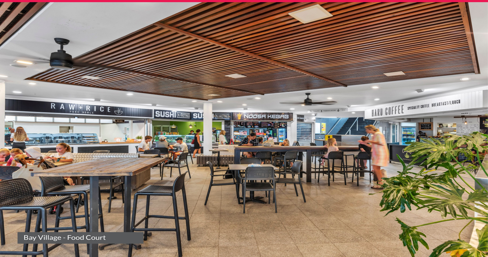
Bay Village - Food Court