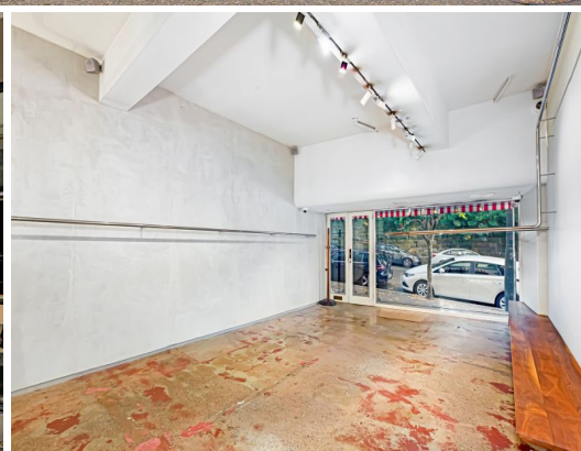
35 Elizabeth Bay Road, ELIZABETH BAY