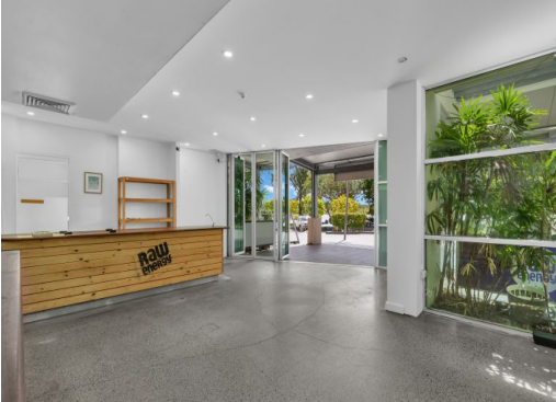
Shop 1/229-231 Gympie Terrace, Noosaville QLD 4566