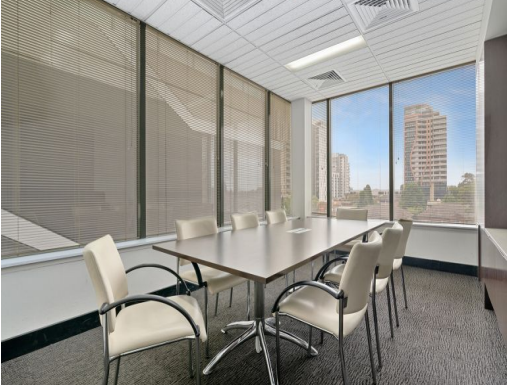
3/4 Railway Parade, Burwood NSW 2134