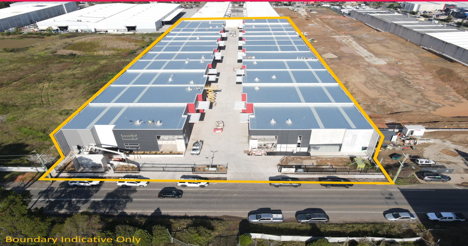
Boundary Indicative Only